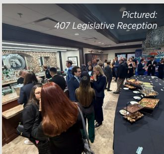
Pictured: 407 Legislative Reception

Hosted the 407 Day Legislative Reception in Tallahassee that brought together 75 key stakeholders, legislators, and community leaders to highlight the Orlando region's efforts to advance Broad-based Prosperity ®.