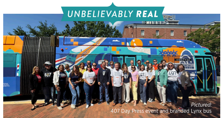
Pictured: 407 Day Press event and branded Lynx bus

Launched the Top 30 MSA Tool, sponsored by Duke Energy, now available at InvestOrlando.org