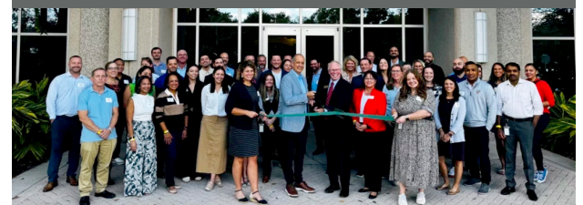
Economic Development Committee sponsored by JQC Services