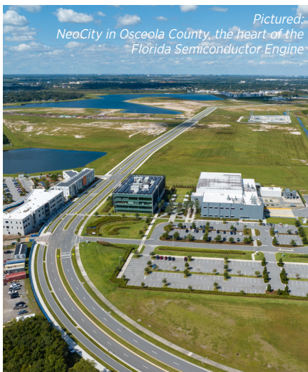
Pictured: NeoCity in Osceola County, the heart of the Florida Semiconductor Engine

Engaged regional education partners to align training efforts with industry needs at: