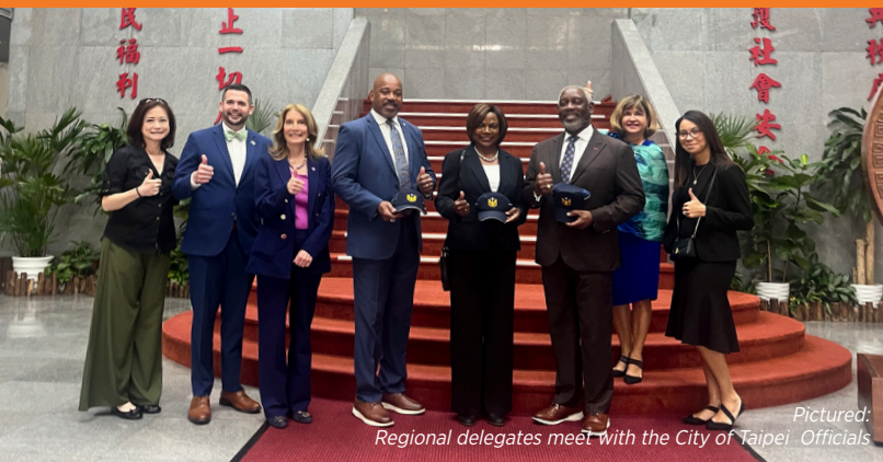
Pictured: Regional delegates meet with the City of Taipei Officials