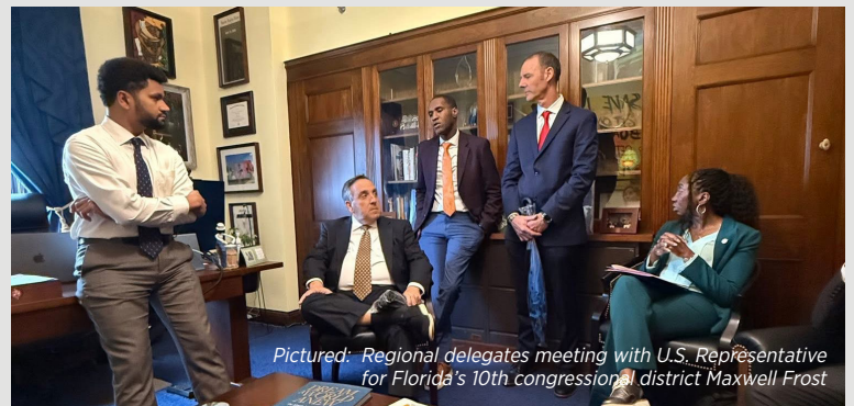
Pictured: Regional delegates meeting with U.S. Representative for Florida's 10th congressional district Maxwell Frost

The Public Leadership Institute (PLI), re-launched its political track and welcomed its inaugural civic leadership track, a new cohort of business-minded leaders preparing to take the next step in public service.