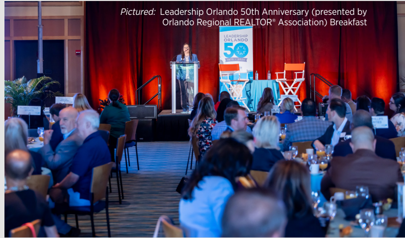
Pictured: Leadership Orlando 50th Anniversary (presented by Orlando Regional REALTOR® Association) Breakfast